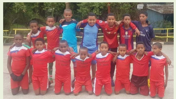
The Football Teams