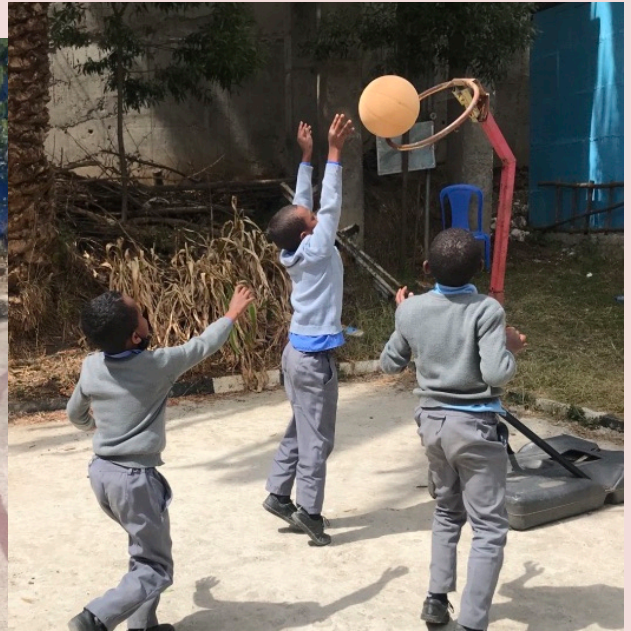
Grade 3 Basketball