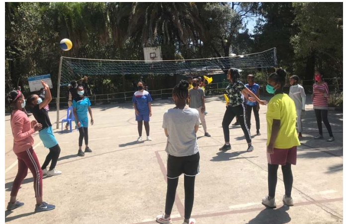
Grade 6 Girls HPE Class