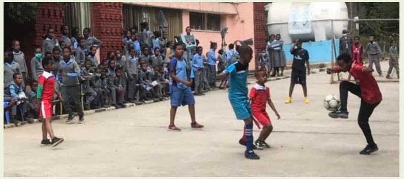
The game and supporters

We, The School of St. Yared, continue to encourage our students to not only achieve their best academically but also physically and socially as an holistic approach to education.