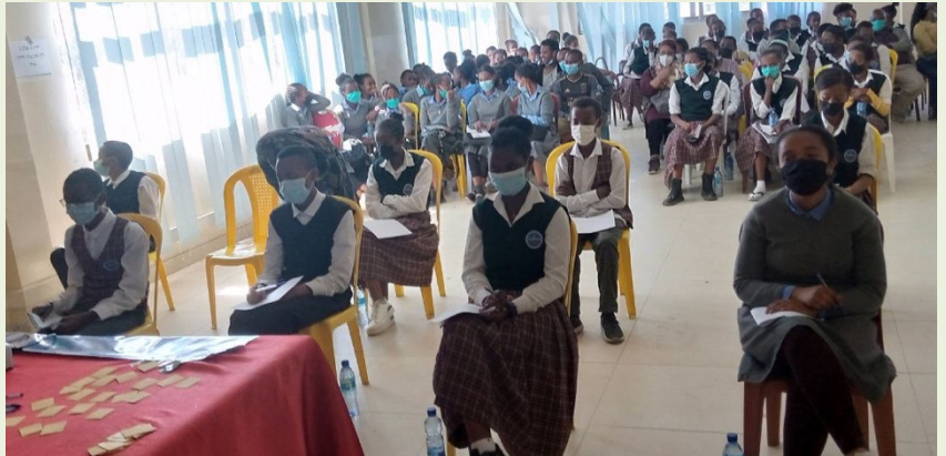
Q. & A Session

storybooks and certificates were awarded to the School. Afterwards, a ceremony was held at St. Yareds to acknowledge and thank the students for their hard work, accomplishments, and a fantastic job done in representing the School.