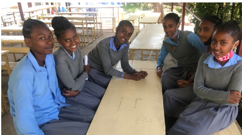
Just Hanging Out