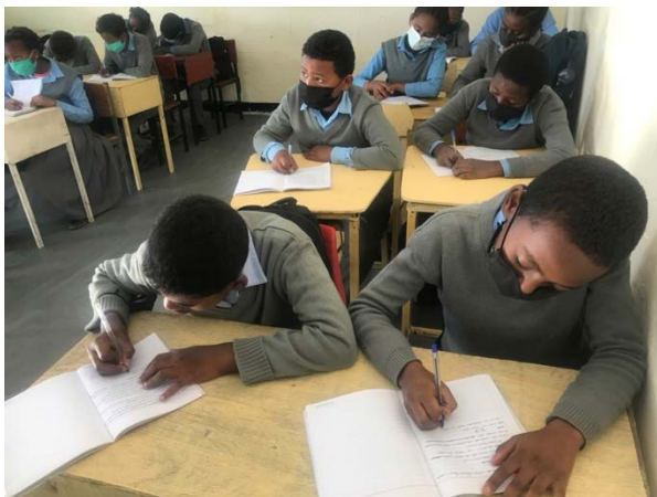
Grade 6 Social Studies