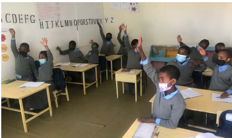
Grade 1 Maths Class