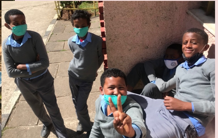
Grade 6 Boys