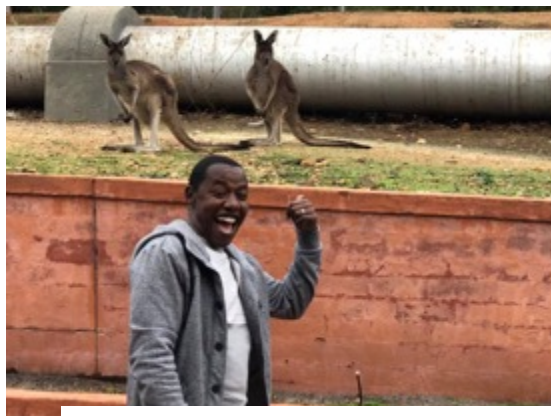
With friends at Mundaring Weir, Perth

For more pictures of Yared's time in Australia click here .