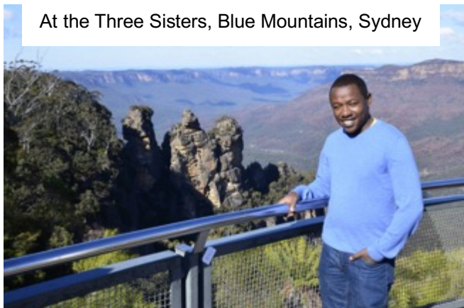
At the Three Sisters, Blue Mountains, Sydney