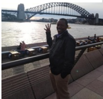
4th time in Sydney