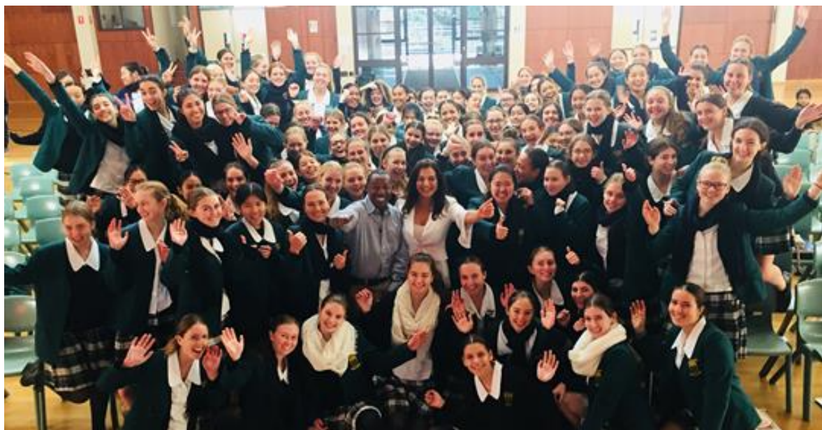
Brigidine College, Sydney