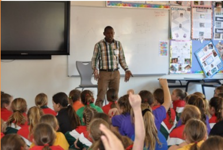
Year 6, Santa Maria College, Perth

Thank you all for your hospitality and support!!