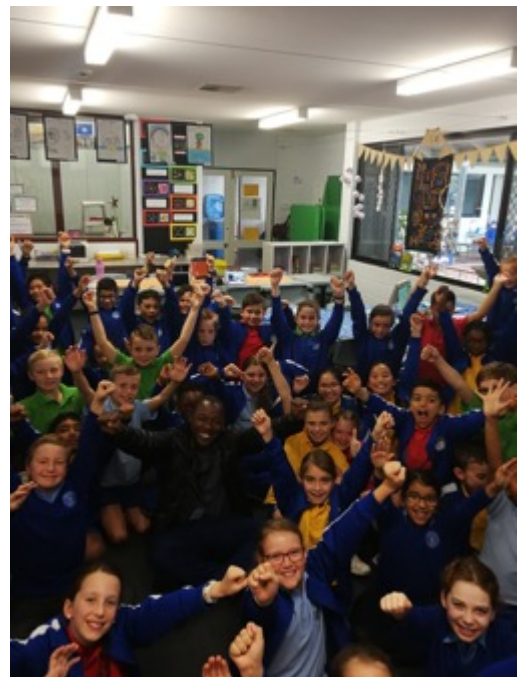
Orana Catholic Primary, Perth