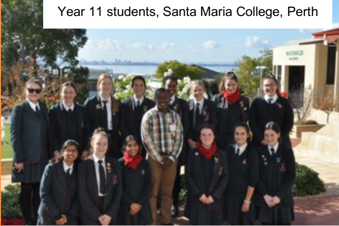
Year 11 students, Santa Maria College, Perth