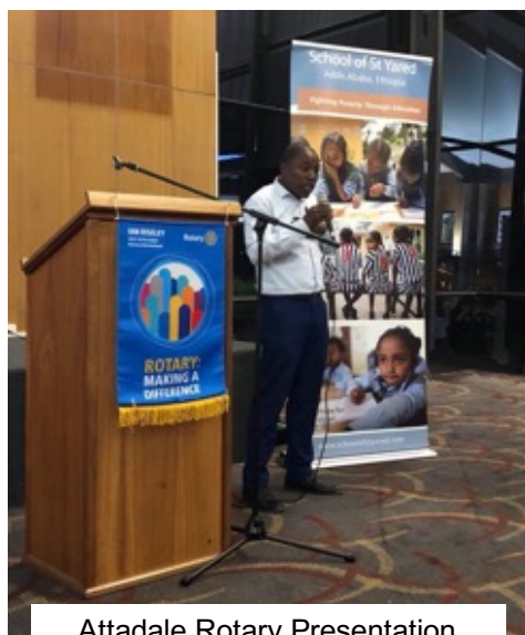
Attadale Rotary Presentation